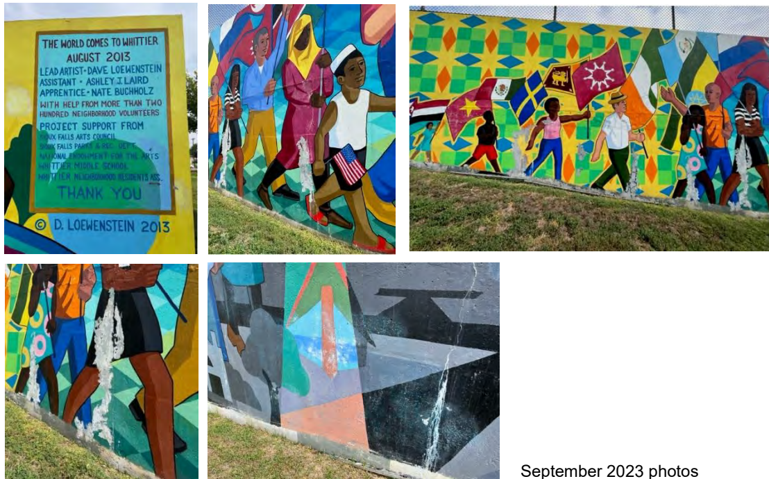
September 2023 photos

It's possible that funds from the R&M budget could go towards the repair of the mural if not from the 2023 budget, possibly the 2024 budget.