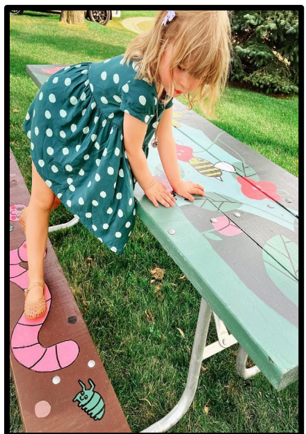
All Saints Neighborhood Painted Picnic Tables 2022