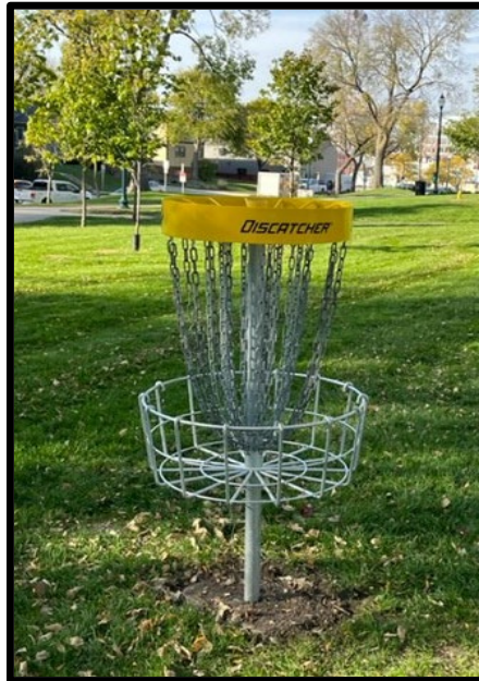
All Saints Neighborhood Lyon Park Disc Golf 2021