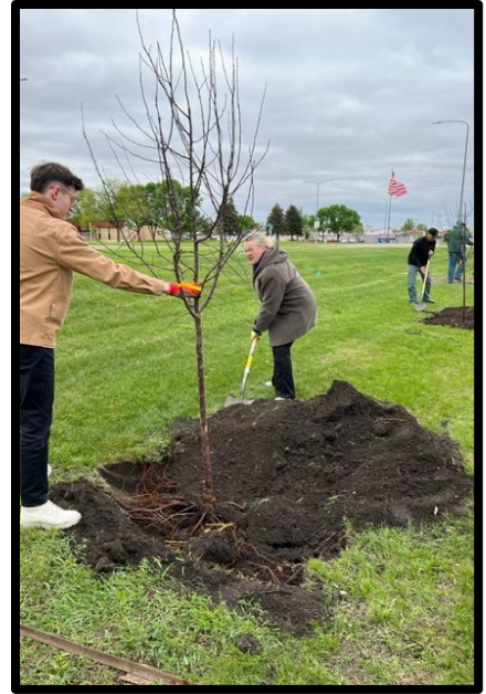
Terrace Park Neighborhood Tree Replacement 2023