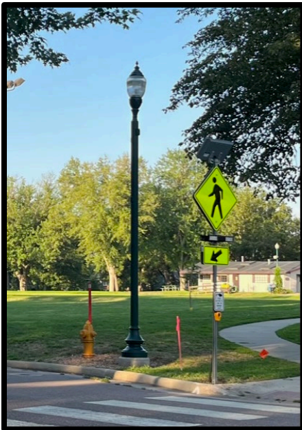
McKenna Park Neighborhood Pedestrian Crossing Solar Signs 2023