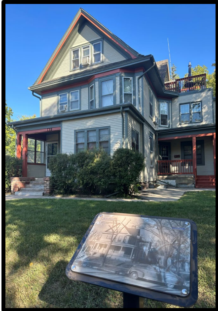
Cathedral Neighborhood Historic Home Exhibits 2023