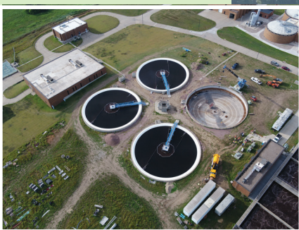
Final Clarifiers and RAS Pump Station

The RAS (return activated sludge) pump station recycles microorganisms back to the aeration basins and transports waste activated sludge to solids treatment. A new RAS pump station will be added to the existing.